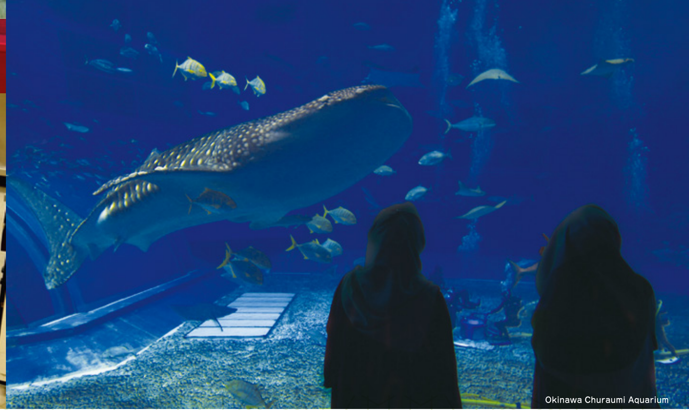
Okinawa Churaumi Aquarium