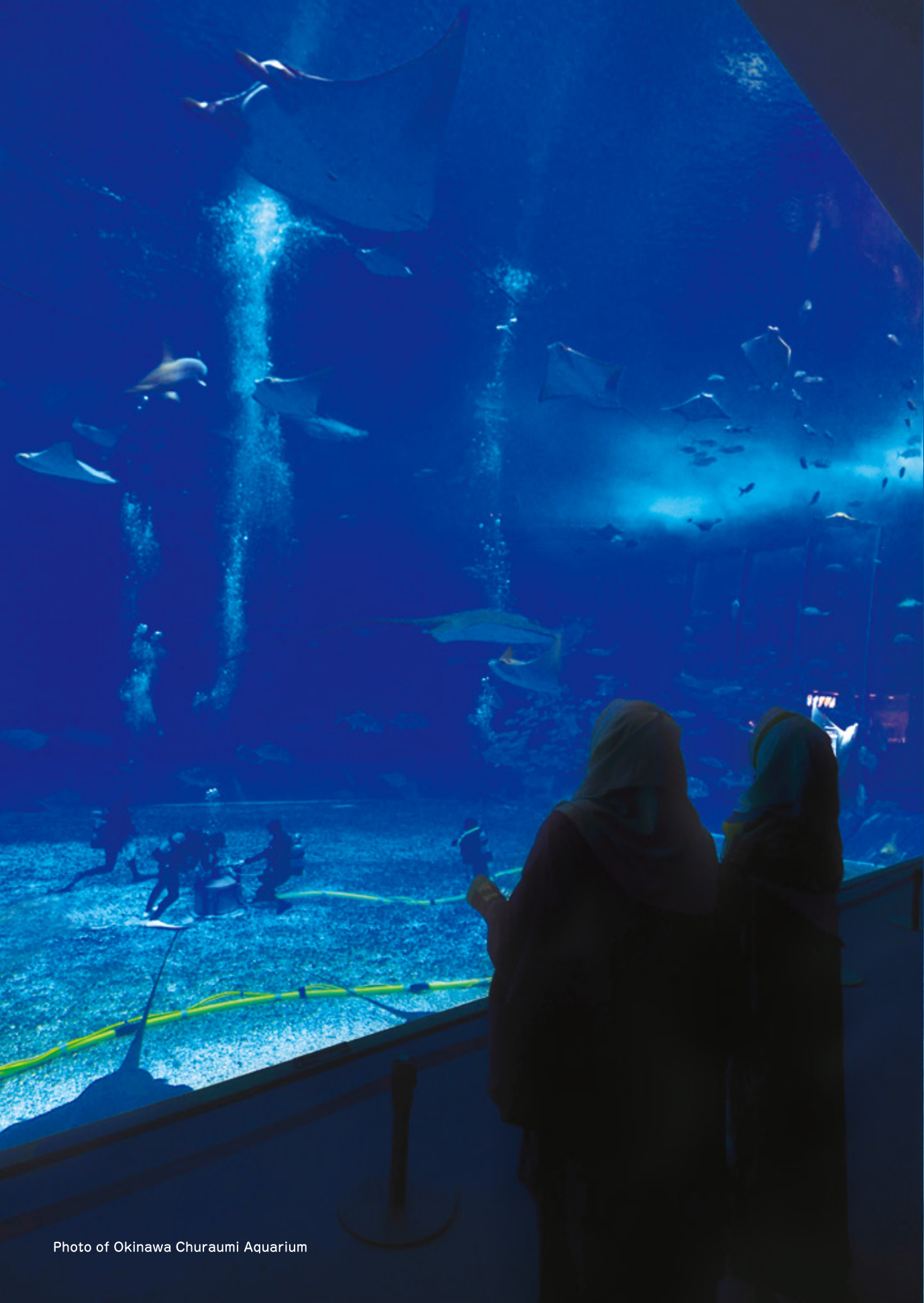
Photo of Okinawa Churaumi Aquarium