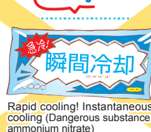
Rapid cooling! Instantaneous cooling (Dangerous substance: ammonium nitrate)